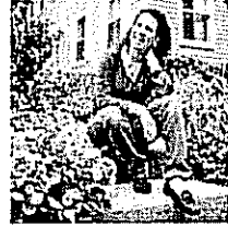
Seriously, She Does Windows

Home World U.S. N.Y. / Region Business Technology Science Health Sports Opinion Arts Style Travel Jobs Real Estate Autos Back to Top Copyright 2009 The New York Times Company Privacy Policy Search Corrections RSS First Look Help Contact Us Work for Us Advertise with Us Site Map