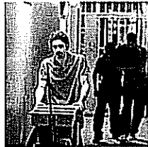
A Film, and France, Look at 'Disgrace' of Prisons