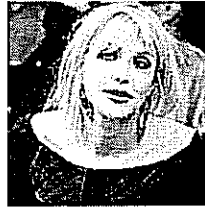
Short Outbursts on Twitter? #Big Problem