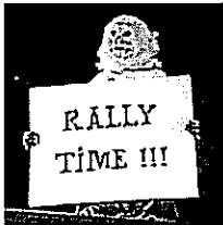
Angels' Rally Monkey Comes Off the Bench